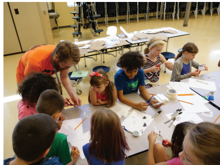
Sparklers personalizing the official Spark Summer t-shirt design.