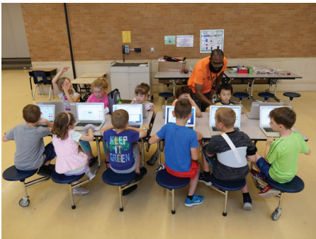
It's time to learn CAD (Computer Aided Design) one of our Maker mark favorites.