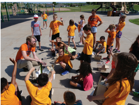
Rocket launches anyone?